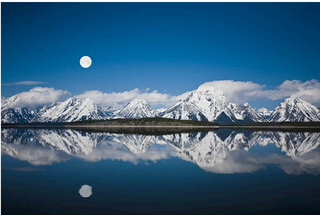
14. Moonset over Grand Teton National Park