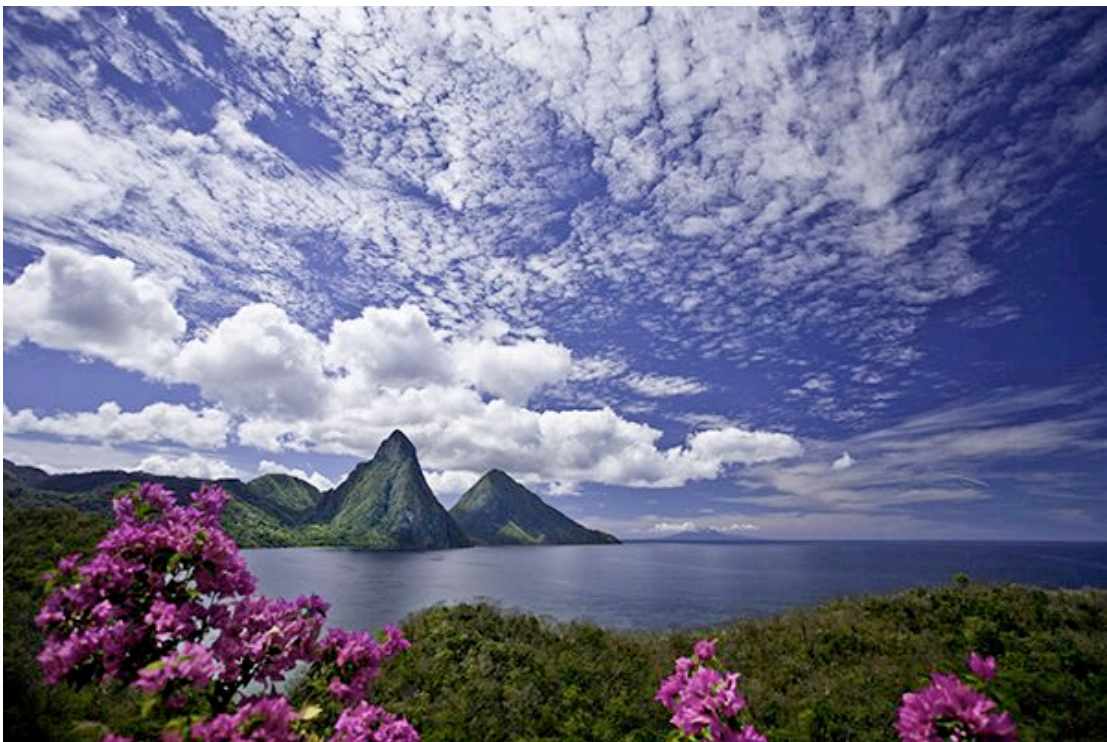
2. Pitons of St. Lucia