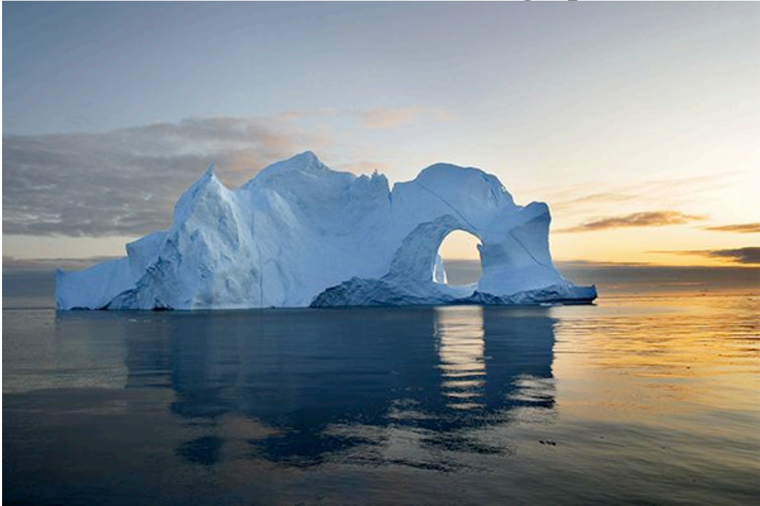
1. Keyhole Iceberg, Illulisat, Greenland