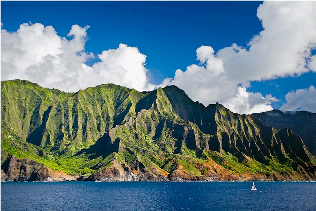
4. Napali Coast, Kauai, Hawaii