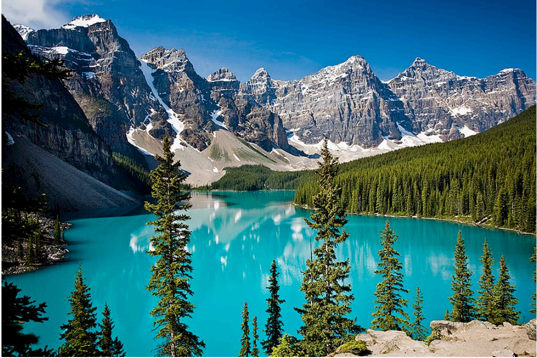
5. Moraine Lake, Banff NP Canada