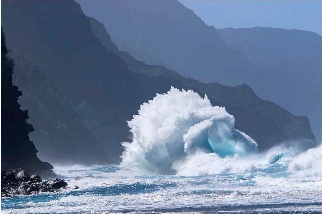
13. Thunder Wave at Napali Coast