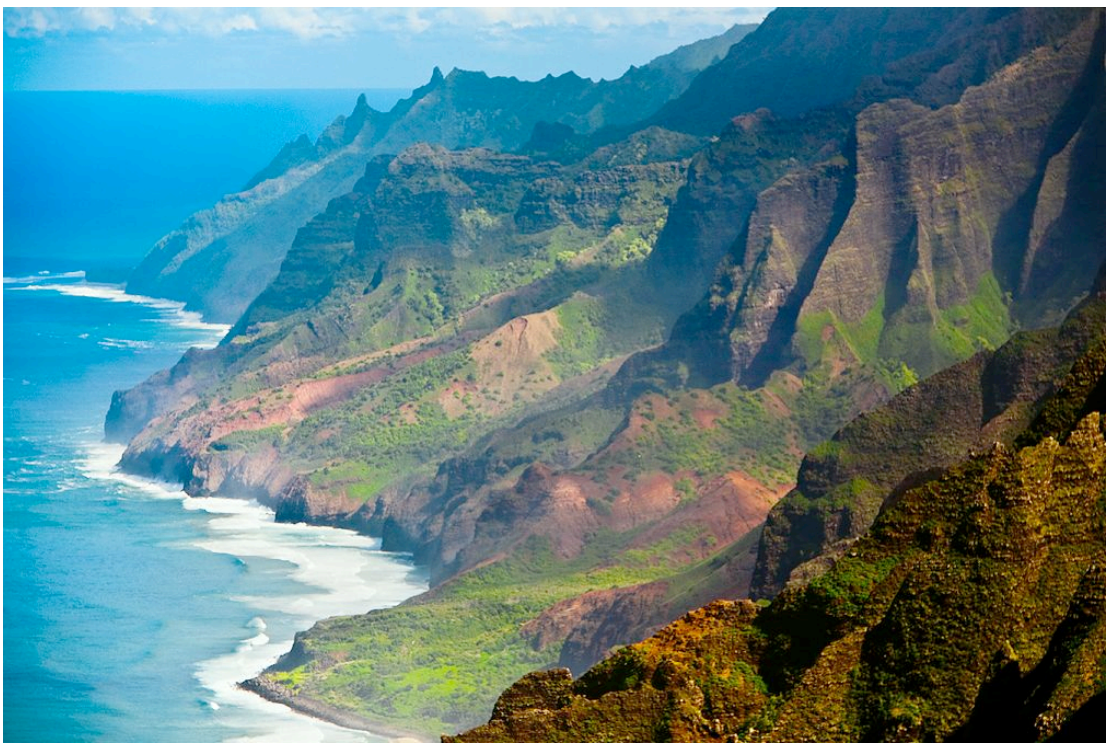
12. Napali Coast, Kauai, Hawaii