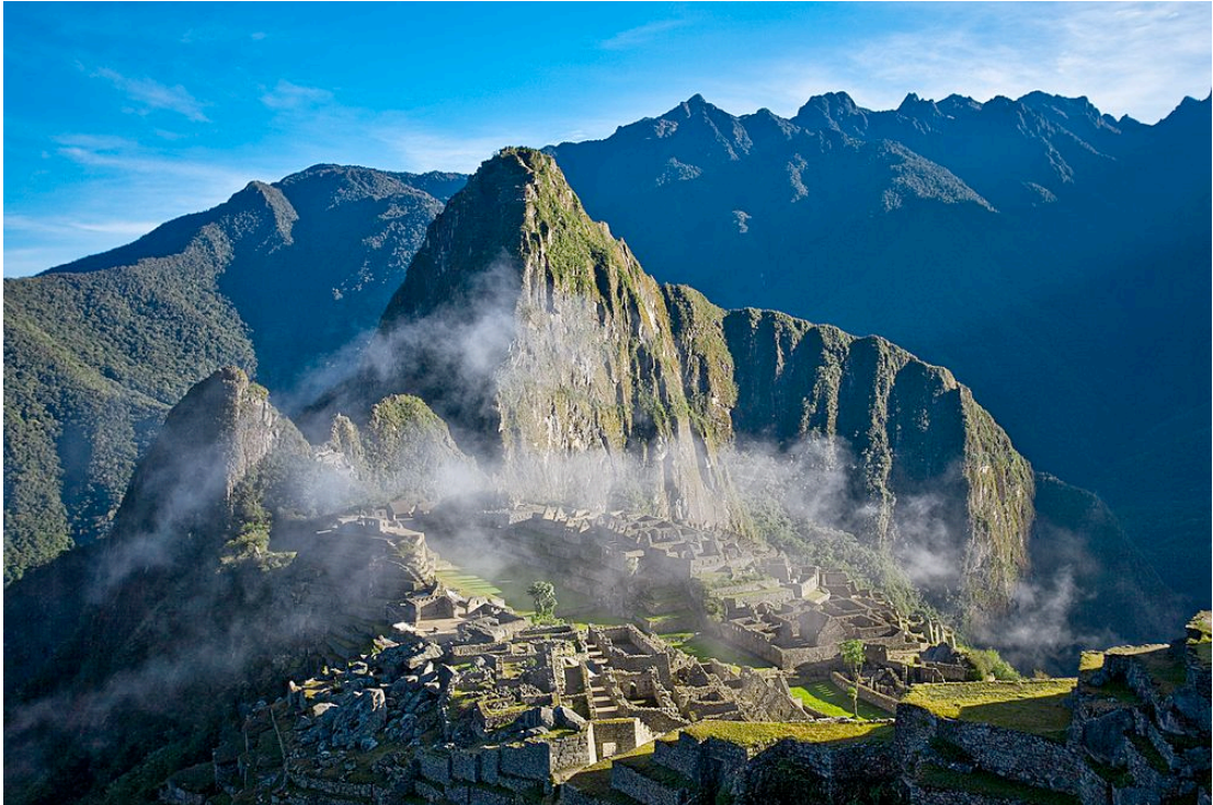
7. Machu Picchu, Peru