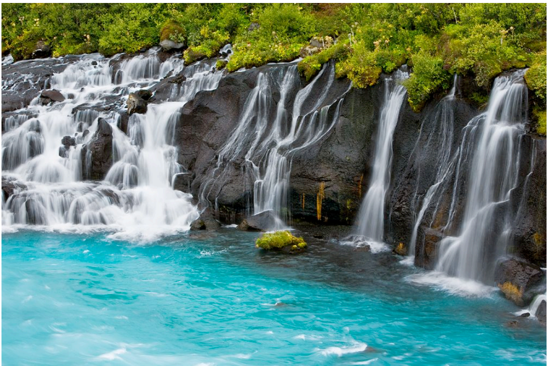
10. Waterfall, Iceland