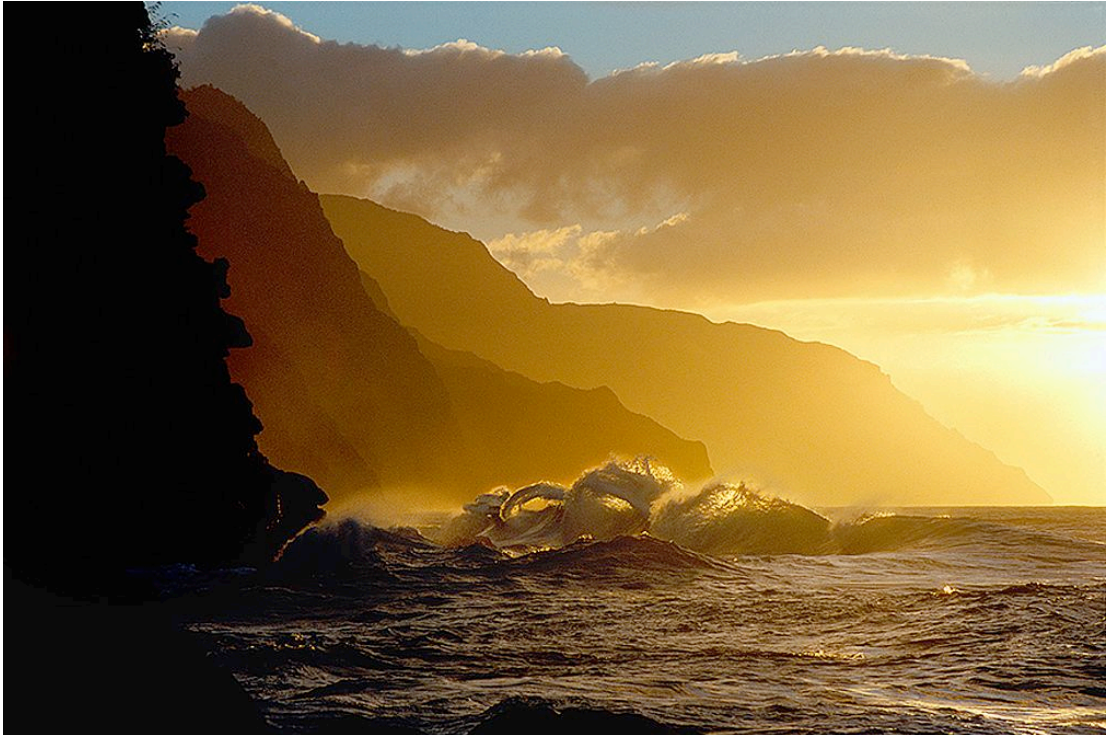
9. Dolphin Waves, Napali Coast, Kauai, Hawaii