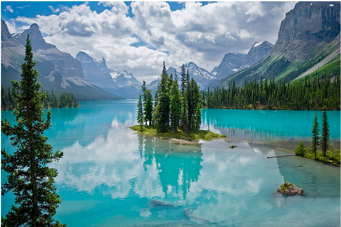
6. Spirit Island, Jasper, NP, Canada