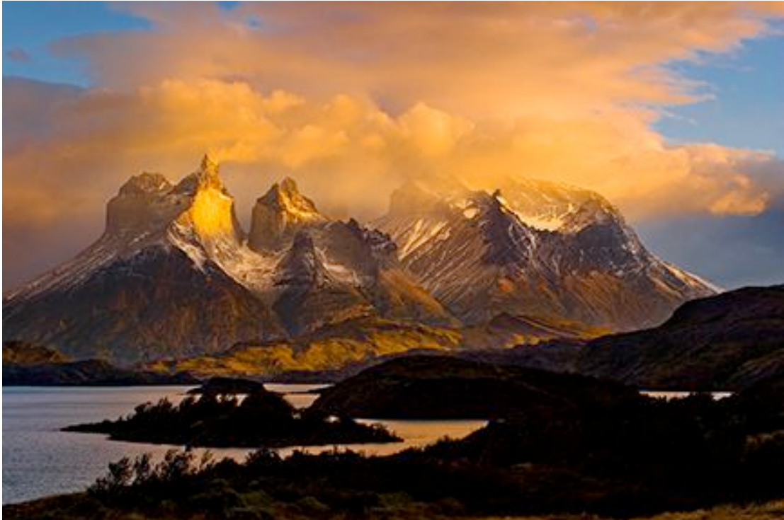
11. Torres Del Paine National Park, Patagonia, Chile