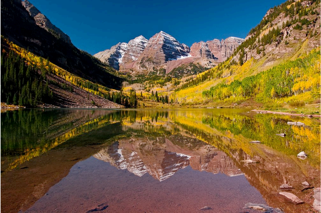
3. Maroon Bells, Aspen, CO